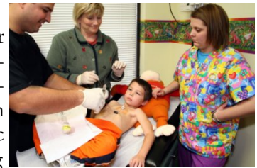
The Famous FROGGY ROOM