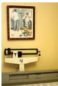
Picture in Eagan Child and Family Care P.A.

Greetings to all new and continuing members! There is much good news to share with you about our MN chapter of NAPNAP.