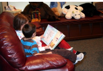
Waiting Area at ECFC

Gretchen's first job as a PNP was, perhaps, the single greatest influ-